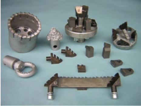
Photo shows root blades, carbide bits, tow ring and special swivel.